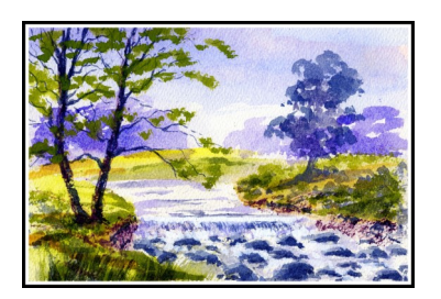
Top: Cascade in Grove Park.

Left top: What the SIR depot at Mitcham may have looked like.